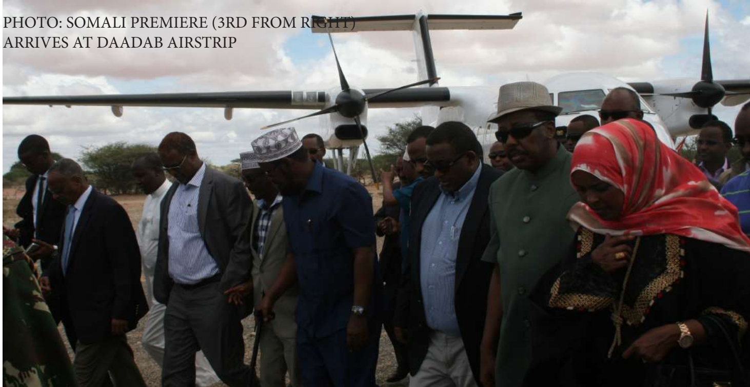
PHOTO: SOMALI PREMIERE (3RD FROM RIGHT) ARRIVES AT DAADAB AIRSTRIP