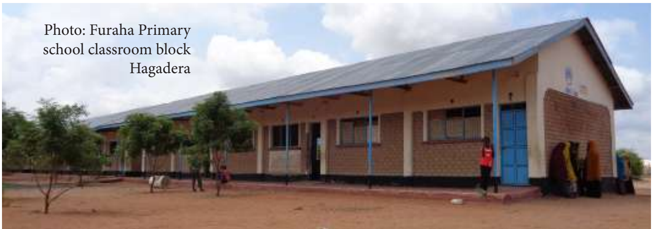
Photo: Furaha Primary school classroom block Hagadera

She hopes that her story would be used by young girls to defy practices that hinder their growth and uproot them off the fertile soil of education.