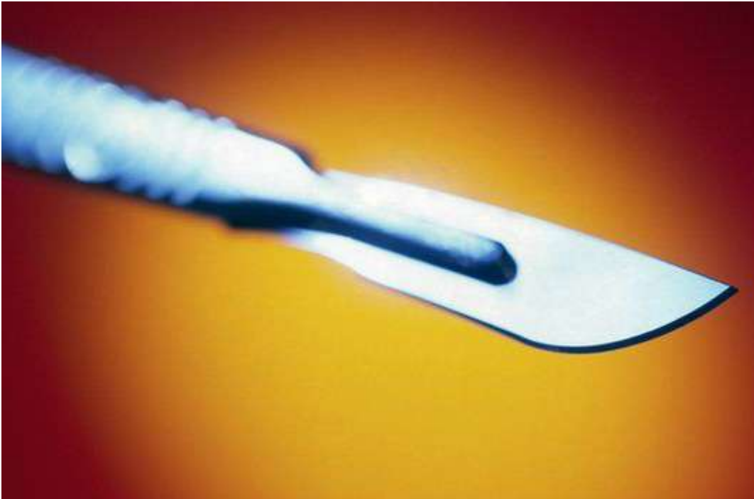
PHOTO: A surgical scalpel. Girls who undergo FGM are at heightened risk of infection, prolonged bleeding and infertility