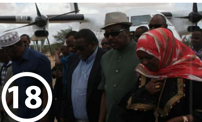
18. SOMALI PREMIERE IN DAADAB FOR REPATRIATION TALKS

PLUS! EXCLUSIVE! FILMAID'S 9TH FILM FESTIVAL PHOTO ALBUM