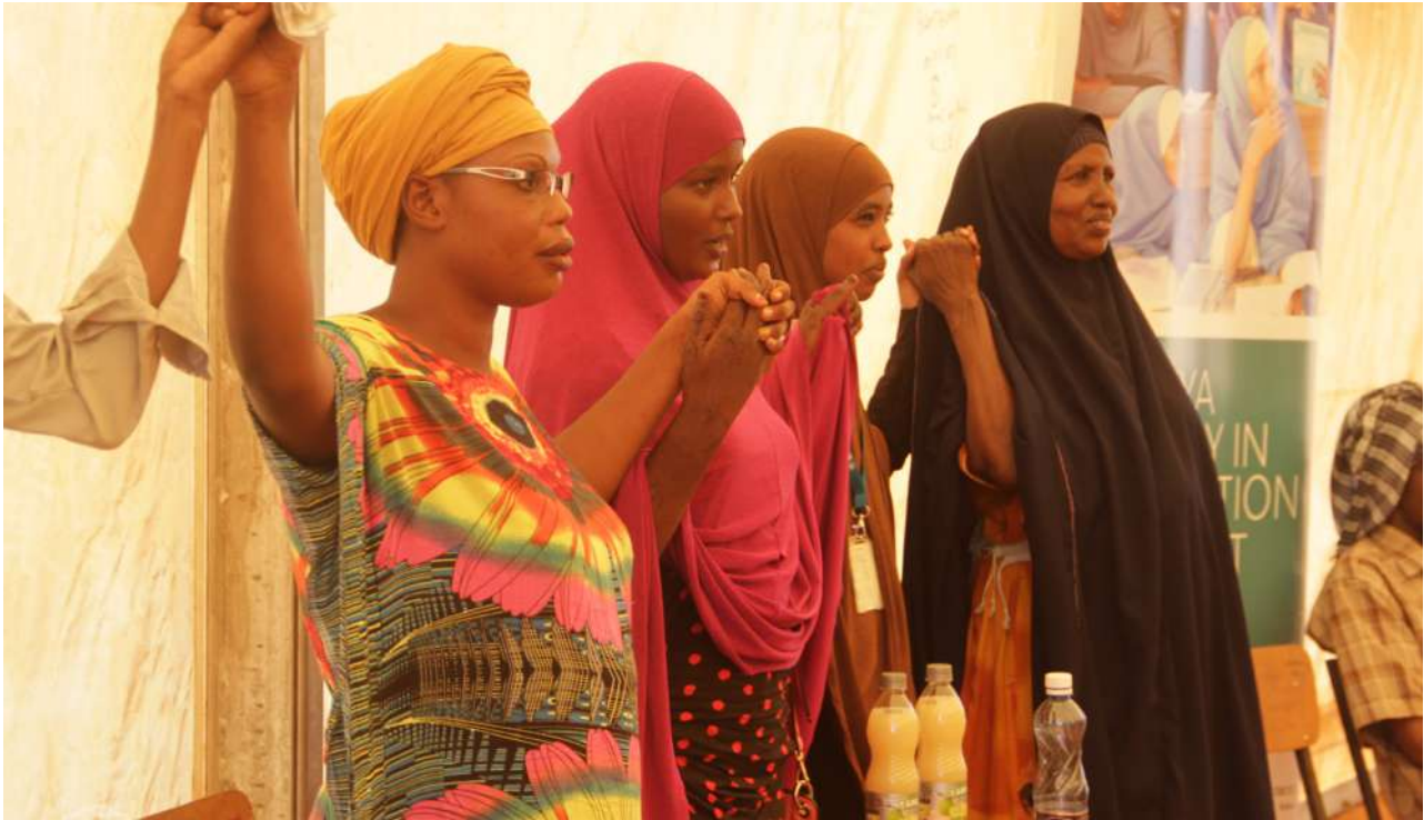
PHOTO: GUESTS HOLD HANDS AT THE INTERNATIONAL DAY OF GIRL CHILD CELEBRATIONS AT IFO