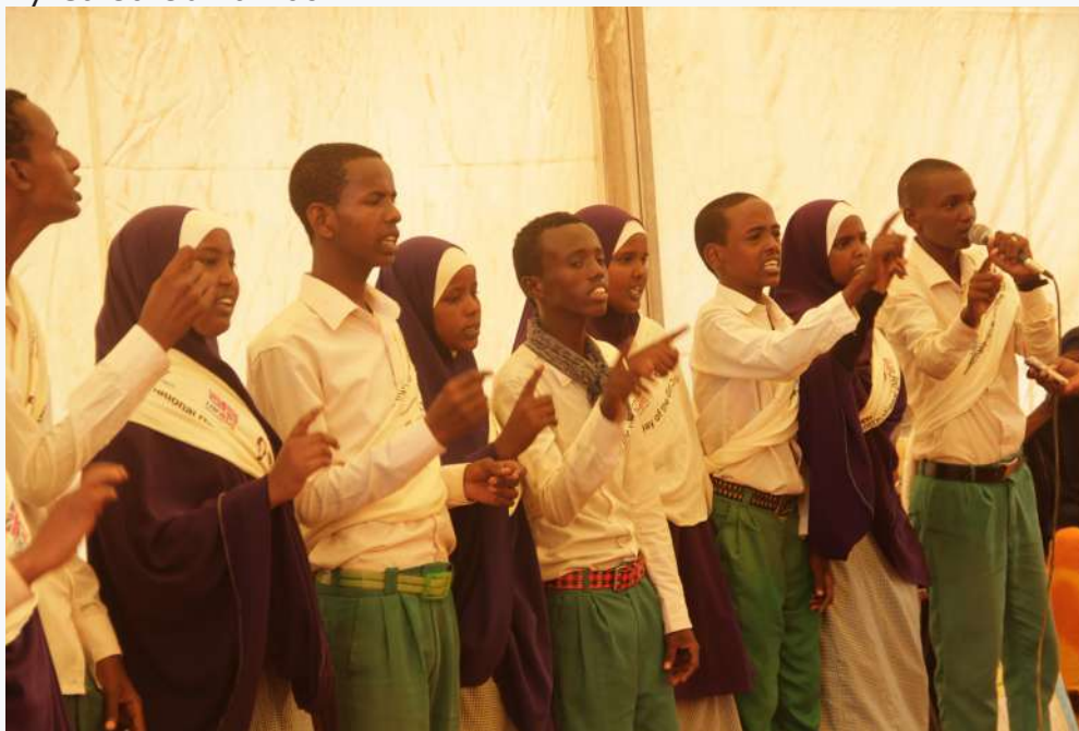
PHOTO: Pupils reciting a poem during a education event organized by Windle Trust Kenya in collaboration with FilmAid International.

“The one thing all children have in common is their rights. Every child has the right to survive and thrive, to be educated, to be free from violence and abuse, to participate and to be heard”