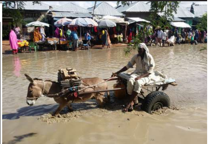
PHOTO: FLOODS IN HAGADERA MARKET

T he Meteorological Department issued early warnings that the country will experience heavy rains in the period October to December 2015. The El-Nino phenomenon is likely to continue in some parts of the country up to January 2016.