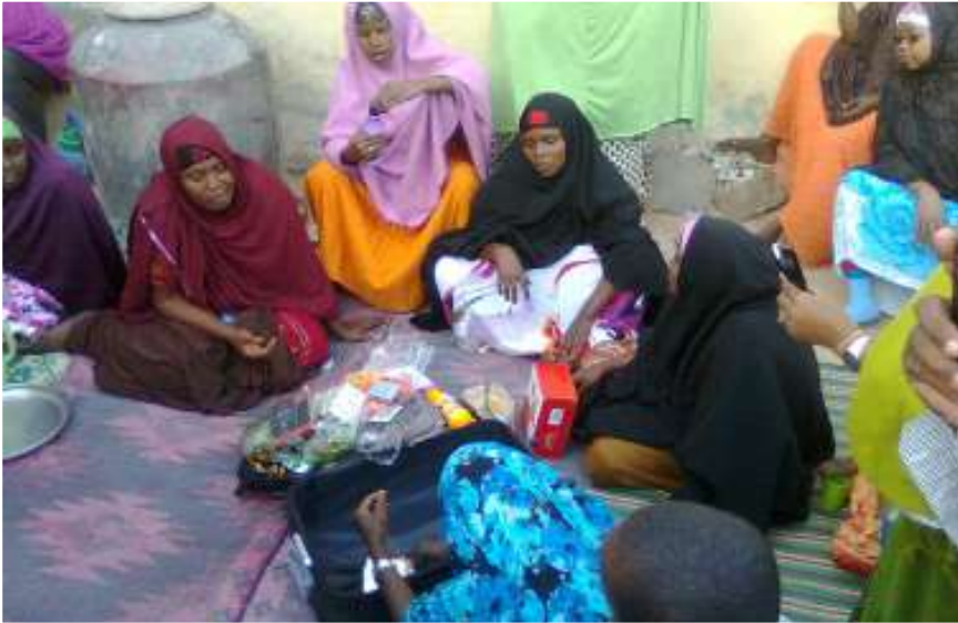
PHOTO: WOMEN SEATED WITH GIFTS AT A SOMALI CULTURAL WEDDING